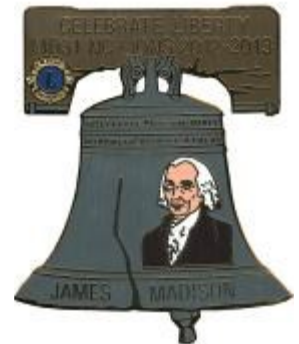
2013 James Madison