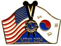
2004 State Convention Pin