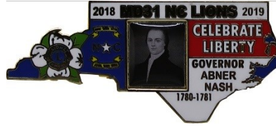
2019 Abner Nash