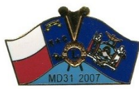
2007 State Convention Pin