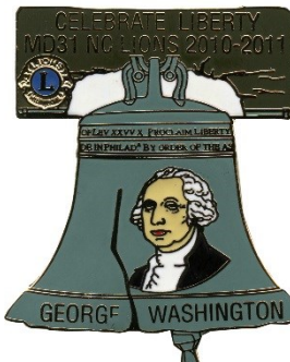
2011 George Washington