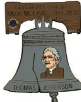
2012 Thomas Jefferson