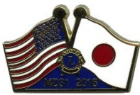
2016 State Convention Pin

NOTE: When the only ID on a pin is the MD designation, we have tried to show those in an effort to assist you in your collection efforts. This is clearly the case for the State Convention pins that merely shows "MD 31 and the date".