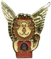
Magnification of Base of Pin MD-31