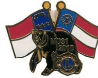
2010 State Convention Pin

NOTE: When the only ID on a pin is the MD designation, we have tried to show those in an effort to assist you in your collection efforts. This is clearly the case for the State Convention pins that merely shows "MD 31 and the date".