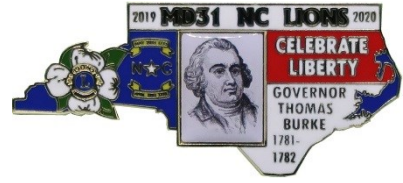
2020 Thomas Burke