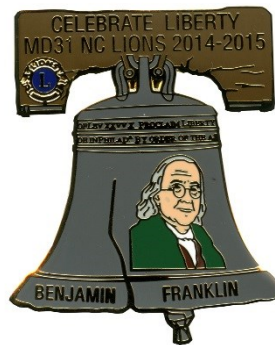
2015 Benjamin Franklin