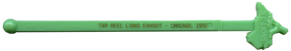
1950 "Tar Heel Lions Exhibit - Chicago 1950" Beverage Stirrer